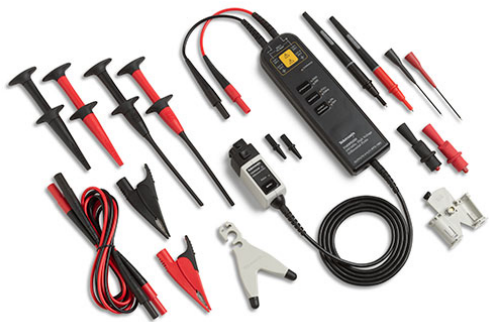
Tektronix Power Probes